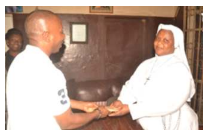
Amongst the distributed items, cash support was also given to them.